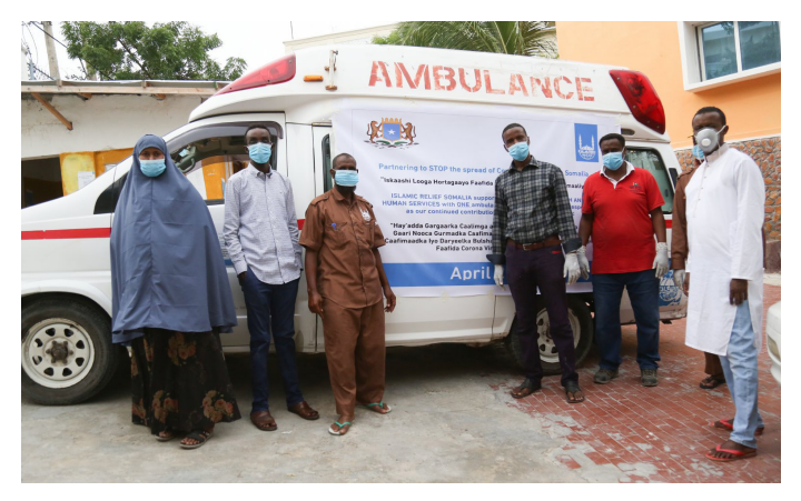
We adapted our COVID-19 response to better support national plans or meet unique local needs, for example, we have donated an ambulance to the Ministry of Health Somalia to help with transporting suspected COVID-19 and other cases to the hospital.

*Islamic Relief is a founding member of the START Network - a network of 42 national and international aid agencies, which oversees the multidonor pooled START Fund that provides fast and direct funding to NGOs for 'under the radar' crises. Members of the Network includes ACTED, International Rescue Committee, Oxfam, Action Against Hunger, CARE International, and many more.