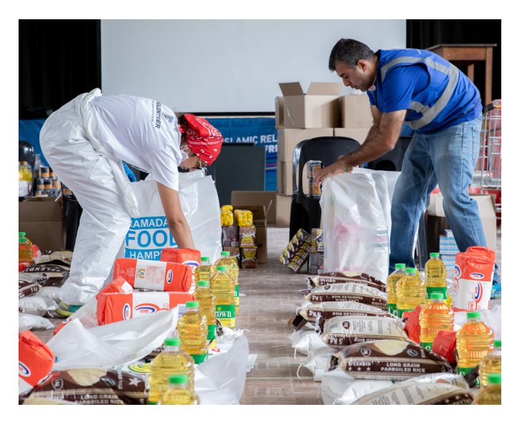
Islamic Relief South Africa has delivered food parcels to over 50,000 people in the Western Cape province of the country.

Islamic Relief operates across five countries in the WASA region: Central African Republic (CAR), through our partners, as well as Malawi, Mali, Niger and South Africa. Assessing the high risk and vulnerabilities of the health systems in these countries, and our presence and ability to scale-up a response, we have placed a specific focus on Malawi, Mali, and Niger.