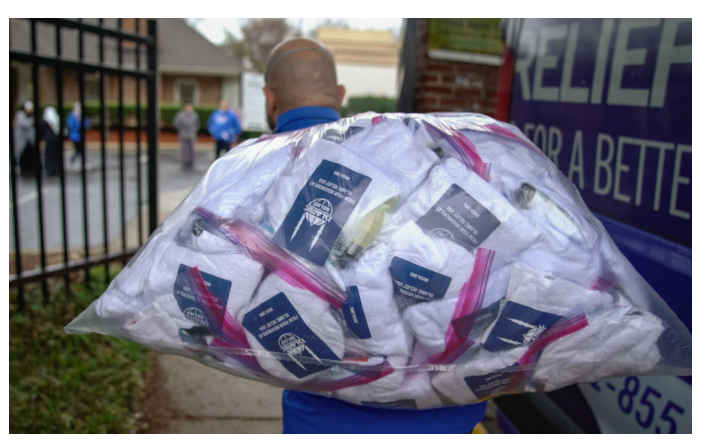
Islamic Relief USA is funding our COVID-19 responses in 15 countries worldwide, including Bangladesh, Mali, Pakistan, and Yemen. It has also dedicated £2.5 million ($3.1 million) to COVID-19 emergency response domestically, providing support to more than 140 partners across 32 states to get critical assistance to communities that are in desperate need of support.