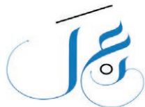
'Adl Social Justice